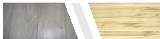
Silver Ash #9902