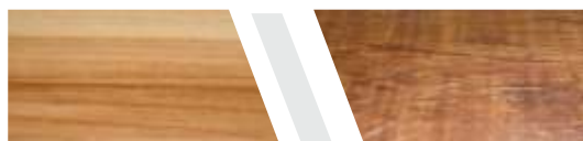
Natural Birch #8667